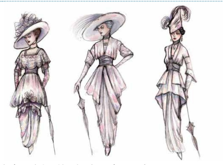
Costume design sketches by Catherine Zuber for Lincoln Center Theater's production of My Fair Lady.