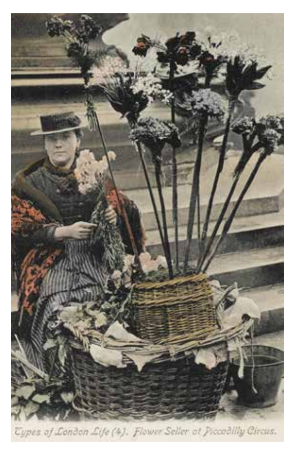
London flower seller.