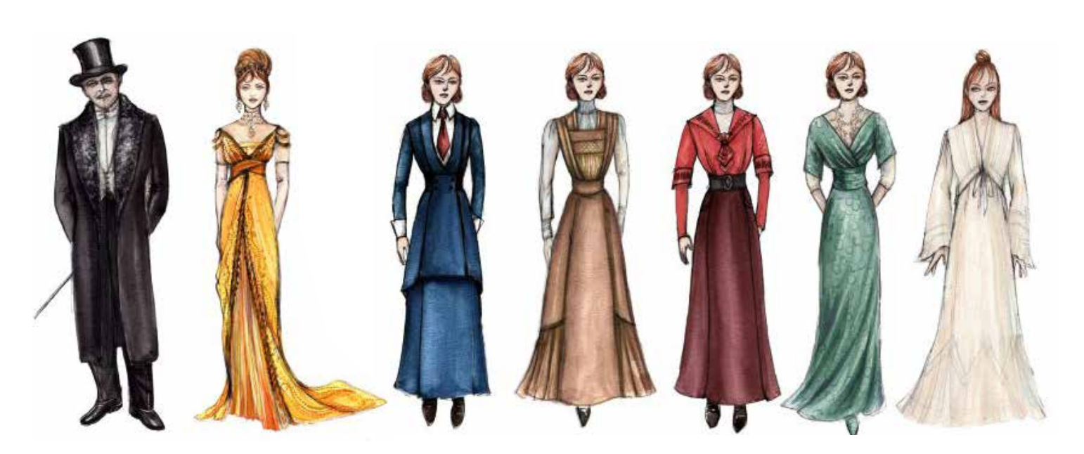
Costume design sketches by Catherine Zuber for Lincoln Center Theater's production of My Fair Lady.

Same number of lines as Verse #1 that rhyme in the same places (same rhyme scheme)